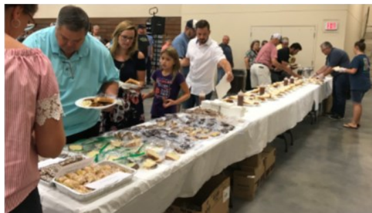
Good Food . . .