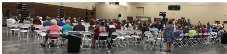
Good Crowd . . .