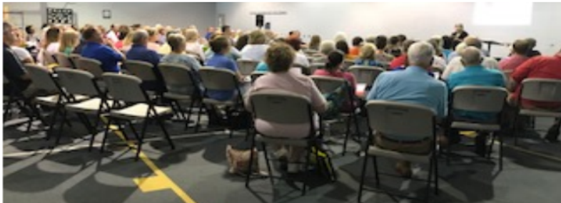
Pictured above are the volunteers who trained in August.

Baron DeKalb Elementary—DeKalb/Flint Hill Bethune Elementary—Pleasant Hill Blaney Elementary—Hillcrest/Blaney Camden Elem.—FBC Camden/Lyttleton St. UMC Doby's Mill Elementary—Spears Creek Jackson Elementary—Wateree Lugoff Elementary—Lugoff FBC Midway Elementary—Cassatt/Providence Mt. Pisgah Elementary—Oak Ridge/Mt. Pisgah Pine Tree Hill Elementary—Mt. Olivet Wateree Elementary—Pine Grove