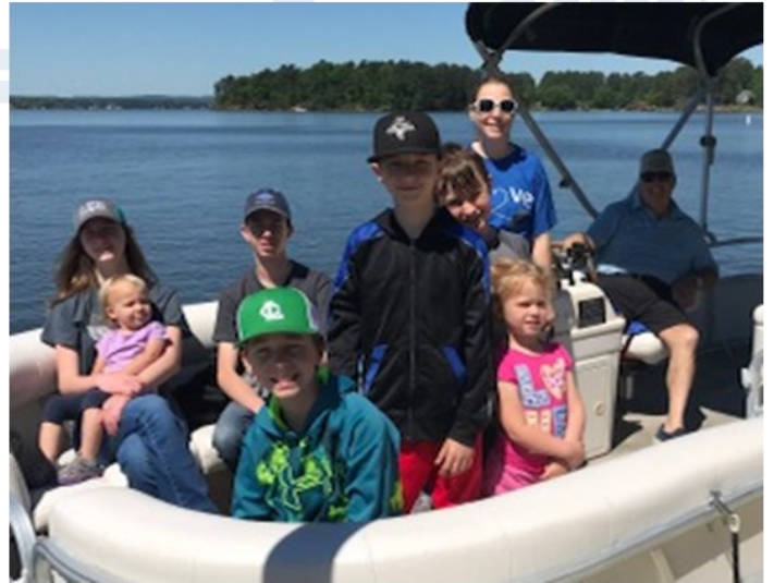
Ready for a ride across the lake!