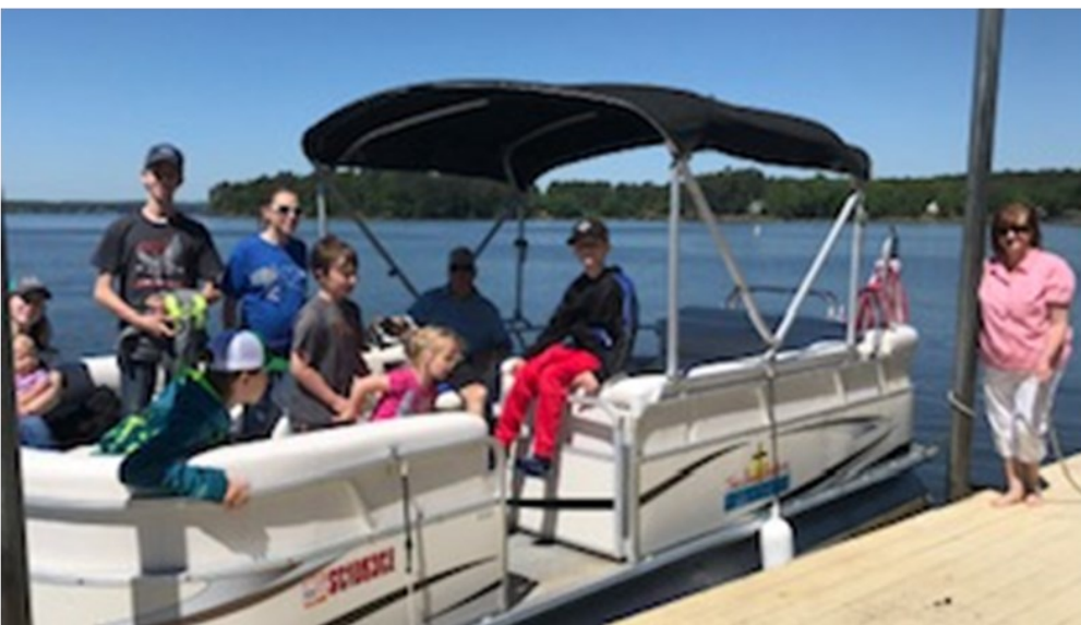
This group was returning from an adventure!