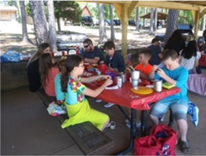
Children and grandchildren enjoyed food, games, and the water.