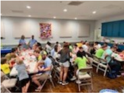
J-1 International Ministry Meal