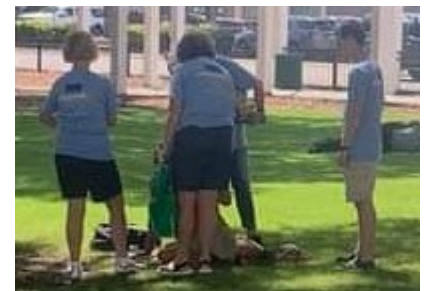
Handing out food to the homeless in Myrtle Beach. But more importantly....Praying with them and sharing God's Word and love!