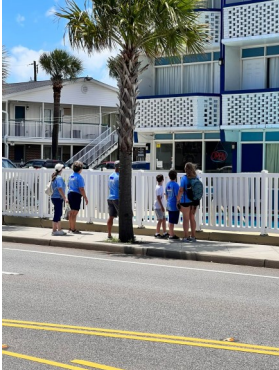
Hotel Hospitality Prayer Walk