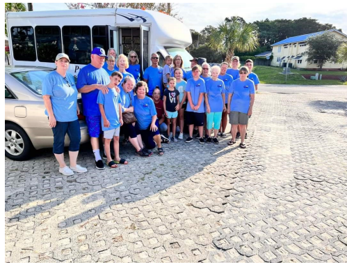
This is our great crew that did all the hard work on the mission trip!