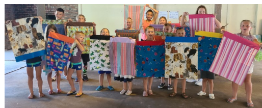
Thanks to Trinity Baptist and Springvale Baptist for the pillowcases!