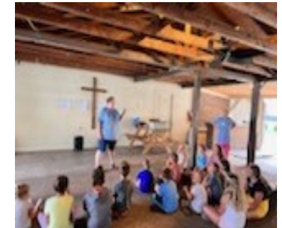
Doing a little bit of crafts and having some fun time playing!