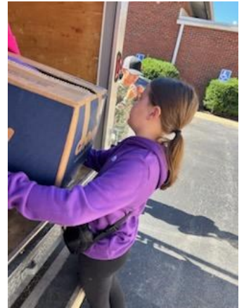
Praise the Lord for the little hands that are willing to serve others!