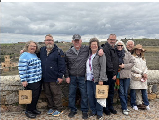
Spain Mission Group

PASTORS CONFERENCE: Will be on Thursday, May 22nd at 11 am. Location to be announced.